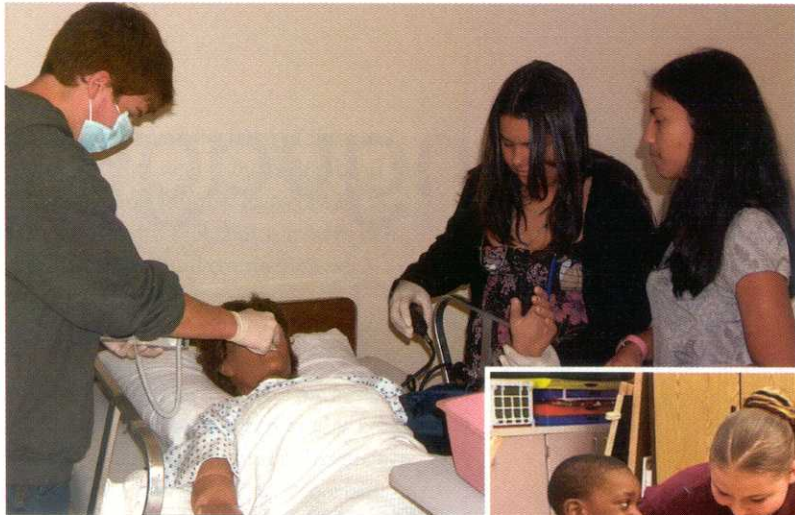
In career academy programs, students are given professional opportunities from a variety of fields, including teacher education and medicine.